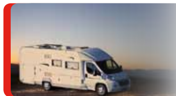
Recreational Vehicles/ Motor Homes