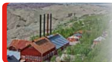
In Building - PBX Integration