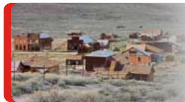
Remote Farms/ Communities

The IsatPhone Pro handset, fits securely in the dock which is also key lockable, other features include phone charging, USB data* port, in-built ringer and allows antenna and power to be permanently connected to the dock ready for use. The IsatPhone Pro handset is easily inserted and removed by the press of a button on the top of the dock making it very easy to use away from the dock when required.